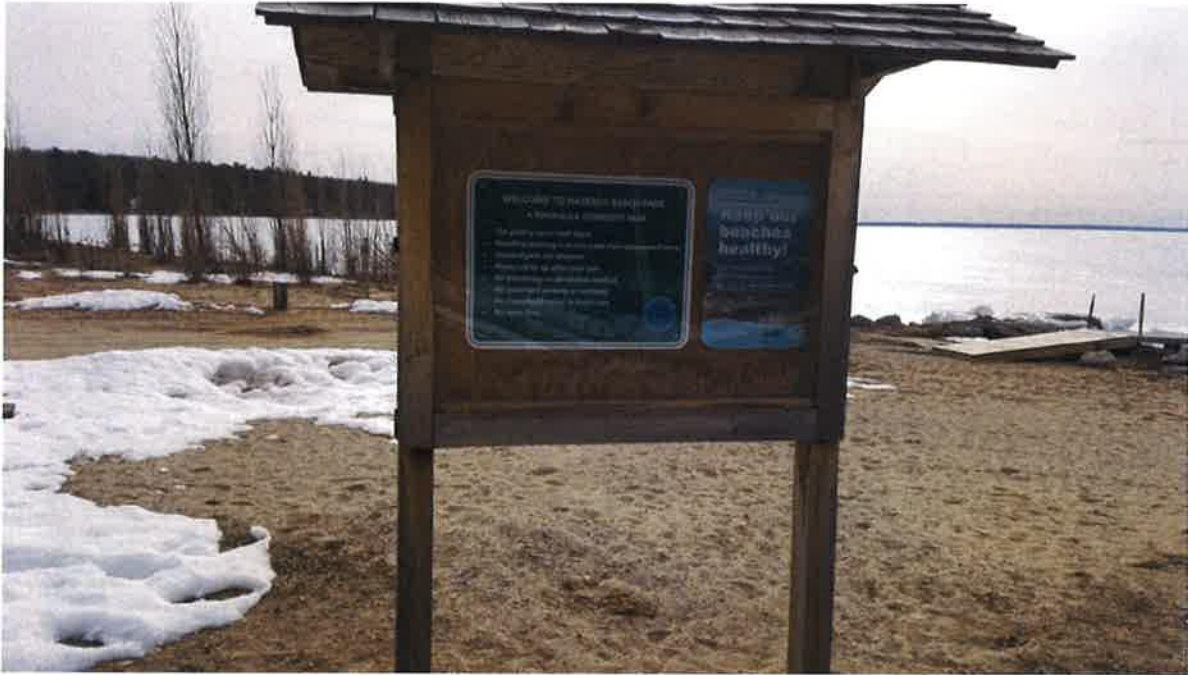
Haserot Beach Park Welcome Sign