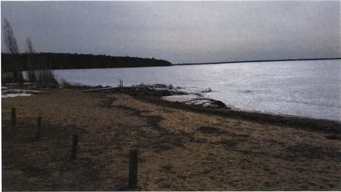
Haserot Boat Launch (Facing East)