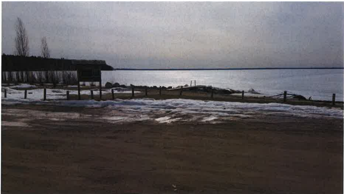
Haserot Boat Launch (Facing East)