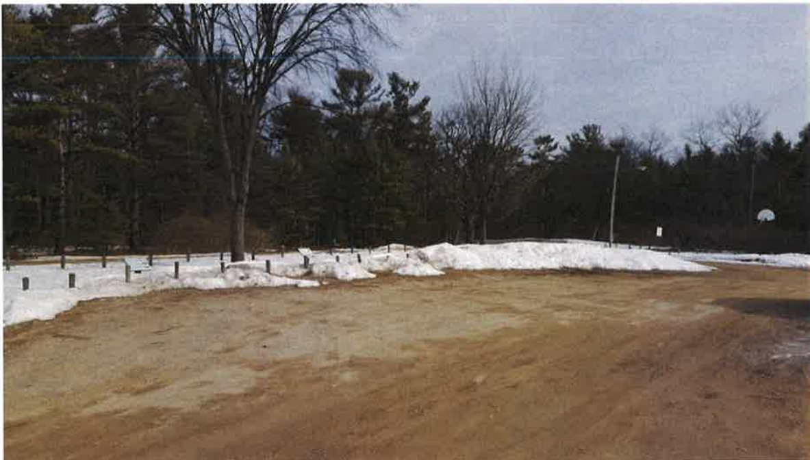
Haserot Boat Launch (Facing West)