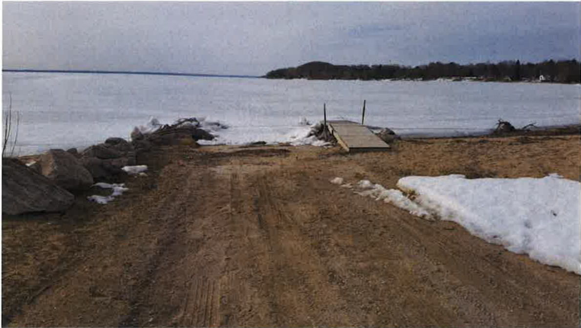
Haserot Boat Launch (Facing East)